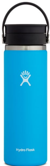
20oz Wide Mouth with Flex Sip Lid